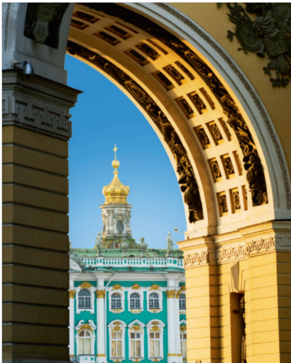
03. Details of Hermitage museum in St. Petersburg, Russia.

This four-star hotel situated in the historical centre of Saint Petersburg is the perfect place for mixing business with pleasure. Ideally located, close to the Hermitage, the Russian Museum and the Mariinsky Theatre, Novotel St Petersburg is the city's best downtown option for business meetings. The hotel comes equipped with 233 rooms, free Wi-fi, meeting rooms, business centre, bar, restaurant and spa to relax. ■